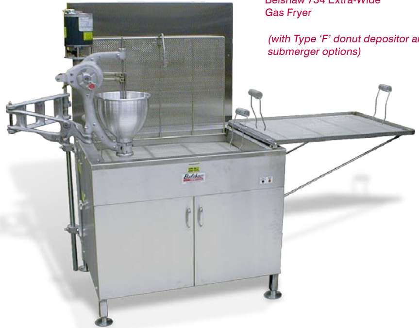
Belshaw 734 Extra-Wide Gas Fryer

(with Type 'F' donut depositor and submerger options)