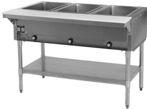
#DHT3-120 hot food table

Eagle Hot Food Tables, open base design, model_____. Top and body to be heavy gauge type 430 stainless steel. Beaded top openings to be 12½" x 20½". Heating compartments to be 8"-deep, galvanized, and insulated on all four sides and bottom with 1" fiberglass or equal. Recessed control panel, with individual infinite controls, offer high and low settings. Each compartment fitted with 500-watt heating element for 120-volt units, and 750-watt heating element for 240-volt units. Six foot cord and plug extends from the bottom right hand side of the unit (not available on 208V/240V 3-phase units). Furnish with polycarbonate cutting board. Legs to be 1½" O.D. tubing, with adjustable undershelf and adjustable bullet feet.