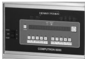
Above: Computron 8000™ control