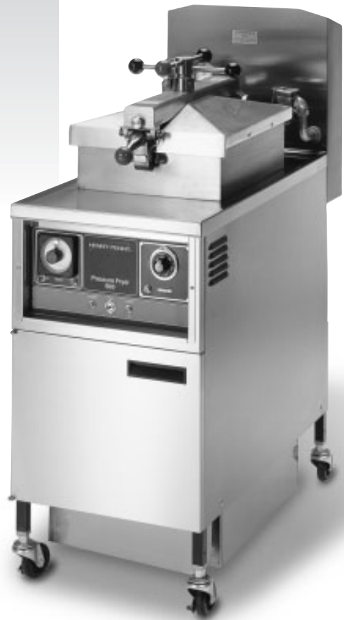
Right: PFE-500 pressure fryer with standard control