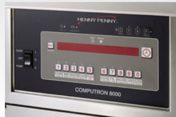
Above: Computron™ 8000 control. Right: PFG-600 gas pressure fryer with electro-mechanical control