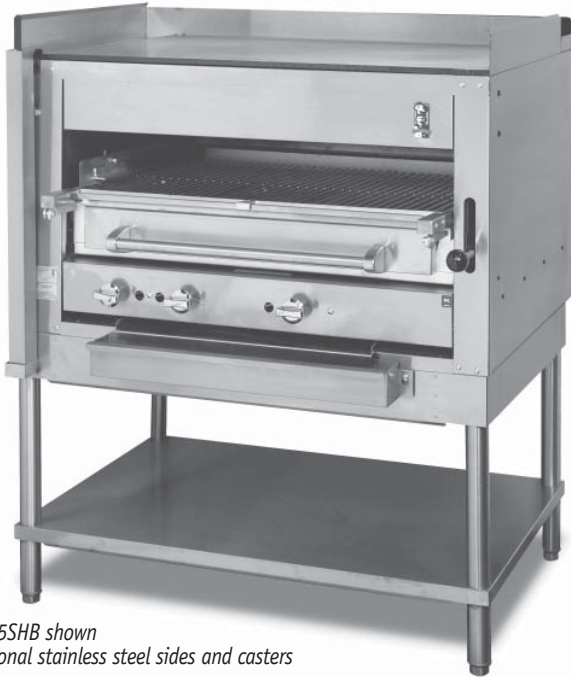
Model C45SHB shown with optional stainless steel sides and casters