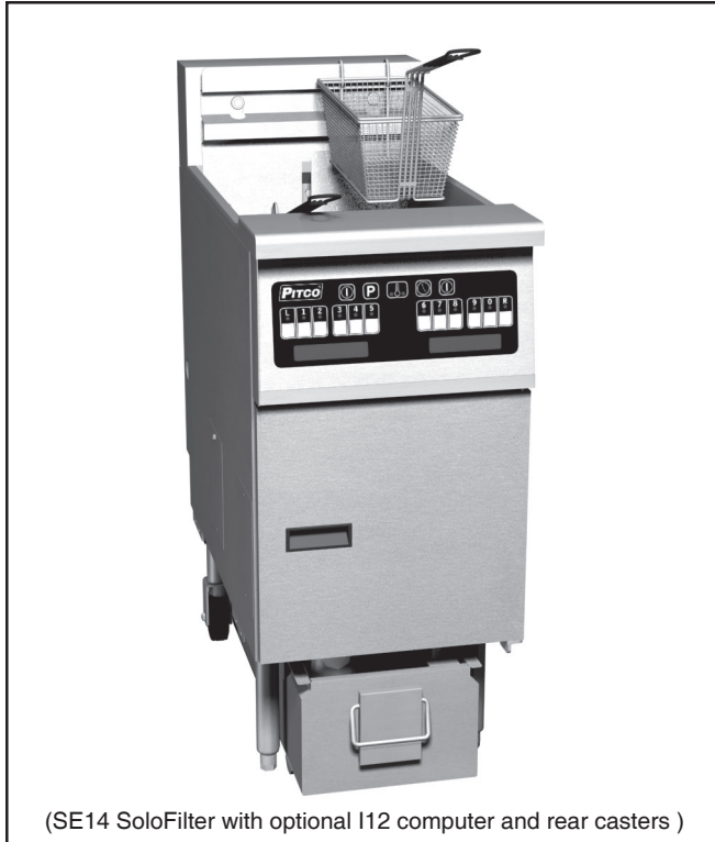
(SE14 SoloFilter with optional I12 computer and rear casters )