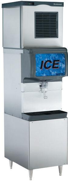
Shown on ID150 dispenser.