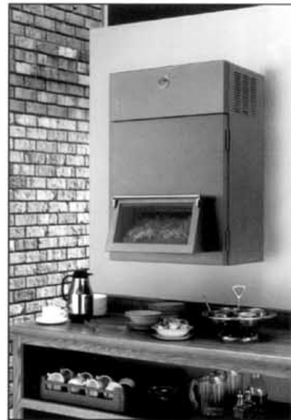
Wall mount kit included