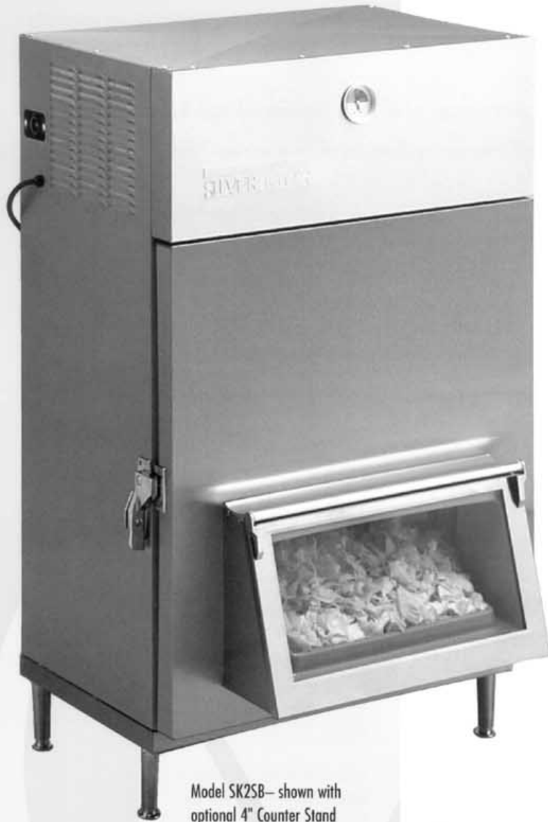
Model SK25B— shown with optional 4" Counter Stand