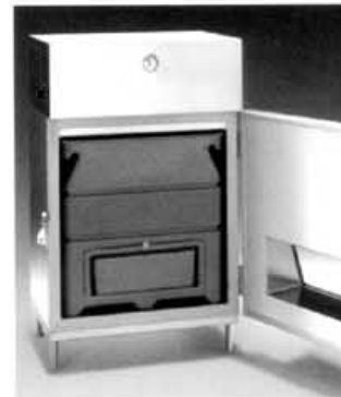
Removable bin holds 50 heads of lettuce. Additional bins available for auxiliary storage.

SILVER KING WE'VE GOT REFRIGERATION DOWN COLD.