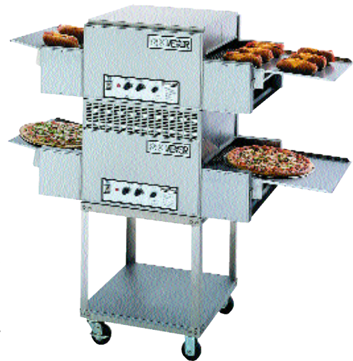
Model 314HX Stacked

Proveyor ovens are covered by Holman's one year parts and labor warranty.