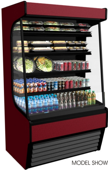
MODEL SHOWN: CO4778R

NOTE: SHOWN W/OPTIONAL Q4296 LAMINATED END PANEL EDGE & STRAIGHT HEADER