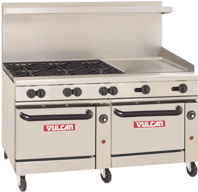
Model 60-SS-6B-24G-N (shown with optional casters)